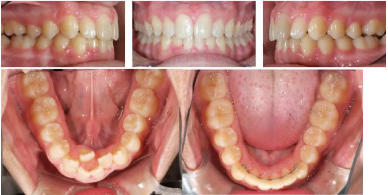
18 months full braces