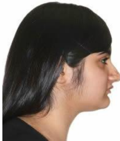
16 years old