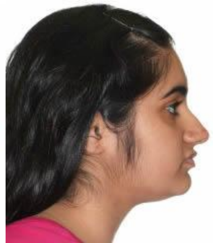
5 months alignment