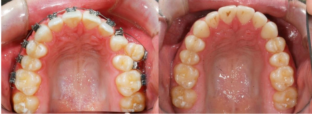
Day of indirect bonding and placement of .012niti _____ Final