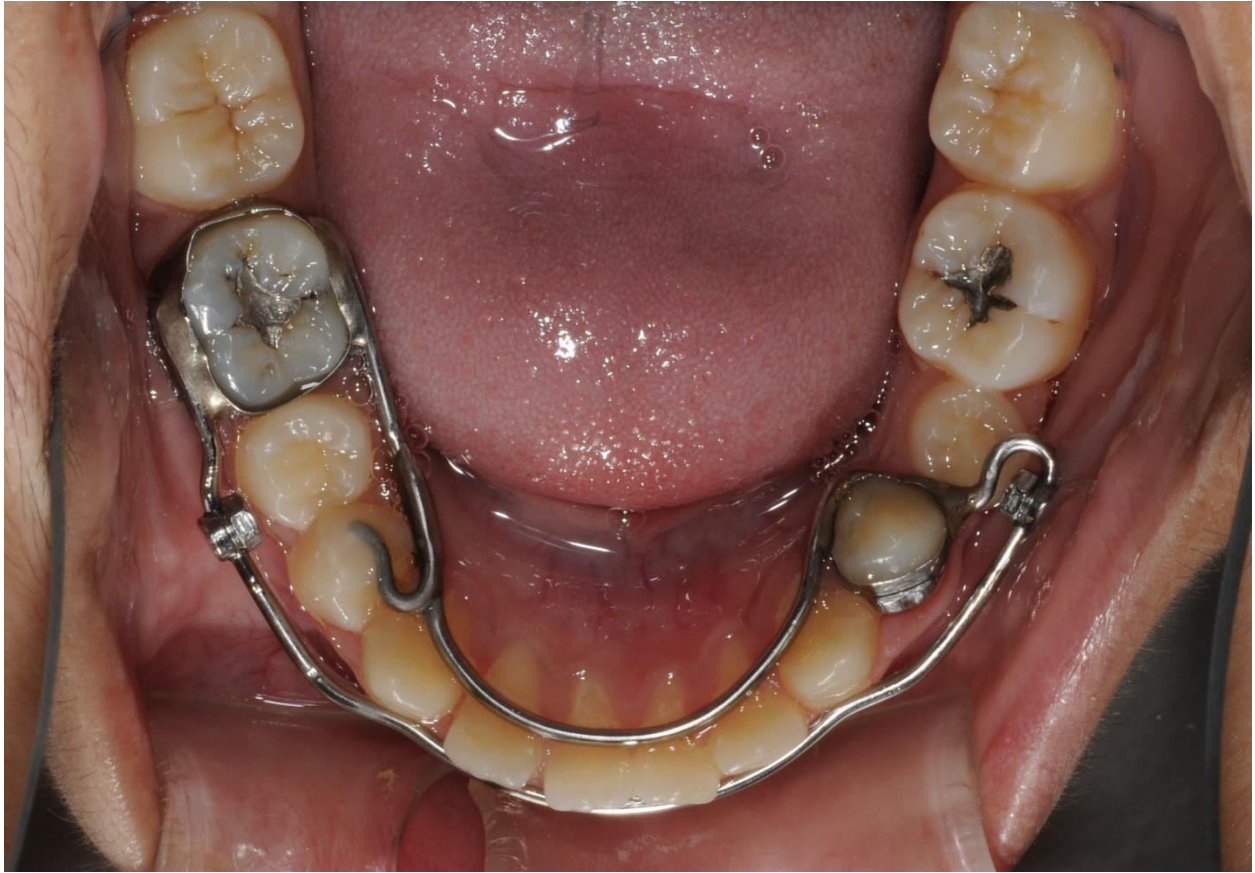
Modified Triple "L" Arch after spring removal and eruption of bicuspid