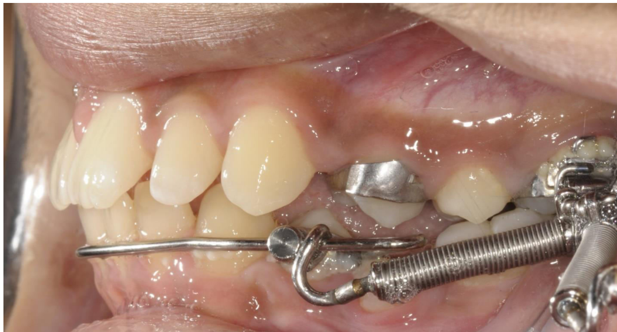
Modified Triple "L" Arch and spring with Rocky Mountain Lock