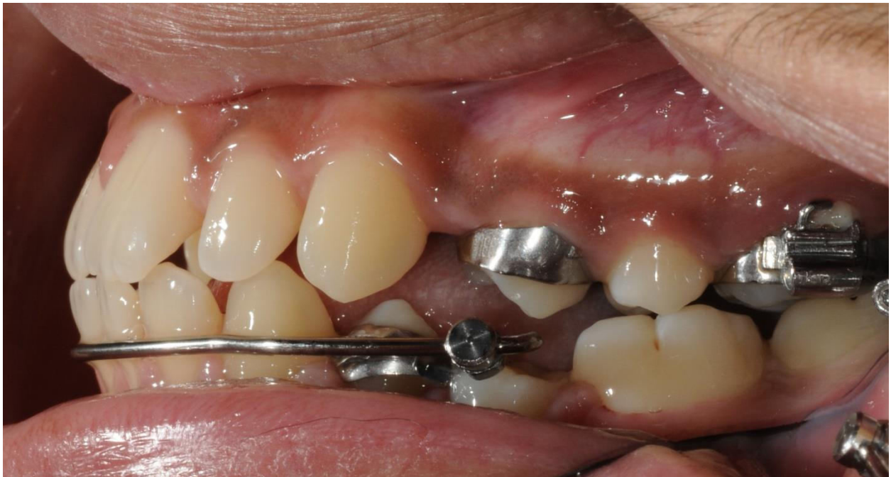
After spring removal and over-correction of Class II to open space for bicuspid