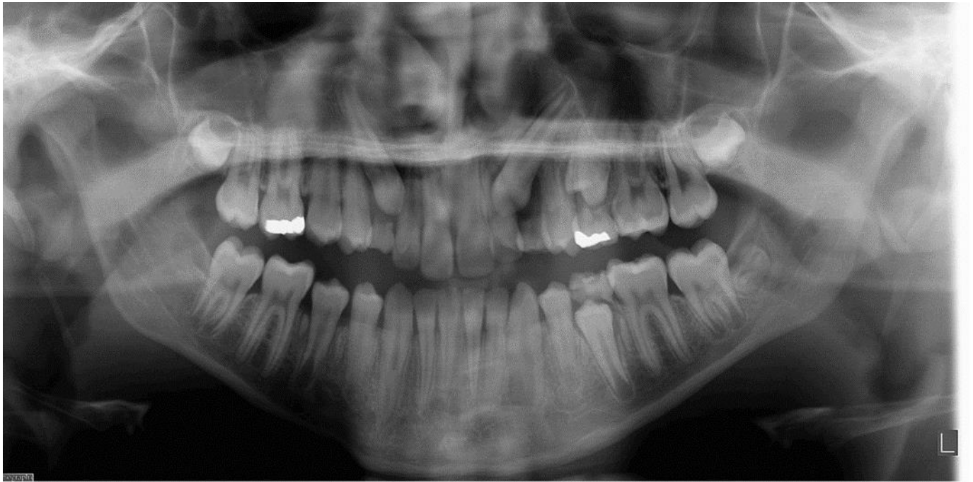
Before Xbow, mesially impacted canines