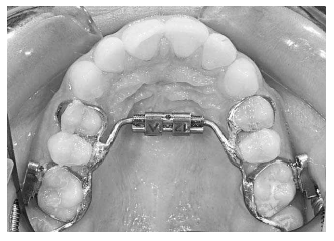
Figure 2. XBow maxillary occlusal 4 banded Rapid Palatal Expander with Forsus connected to the Headgear Tube.

Lately the Forsus spring has been used as the mechanism of force for the Xbow<sup>™</sup> Class II corrector (Xbow). The Xbow (pronounced crossbow) is a patented appliance that uses the Forsus springs as a phase 1 appliance for treatment in the late mixed or early permanent dentition.<sup>13</sup> In a recent study,<sup>14</sup> the Xbow was shown to correct dentally a mild to moderate Class II malocclusion in approximately 4.5 months; then it was removed to allow some musculoskeletal and dental relapse to occur prior to initiation of full fixed edgewise appliances. This result has shown to compare quite favorably with the reported Herbst effects.<sup>15</sup> Some control of the lower incisors inclination is believed to be achieved by a low position of the lower framework.