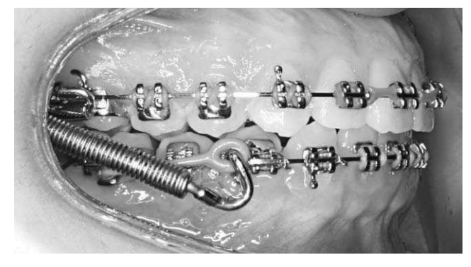
Figure 7. Forsus connected to the archwire, with modifications for less breakage and improved patient comfort (lateral view).

orthodontic treatment) and age at start of treatment were different based on treatment groups and gender. A \chi^2 test was applied to determine if gender distribution was even among treatment groups.