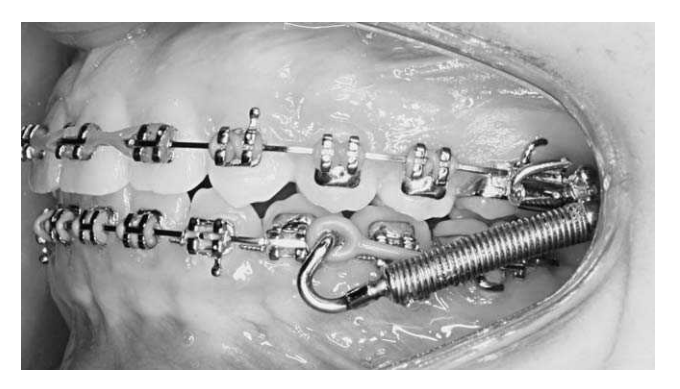
Figure 6. Forsus connected to the archwire, with modifications for less breakage and improved patient comfort (lateral view).

An independent Student's t -test was used to determine if treatment length (number of months in