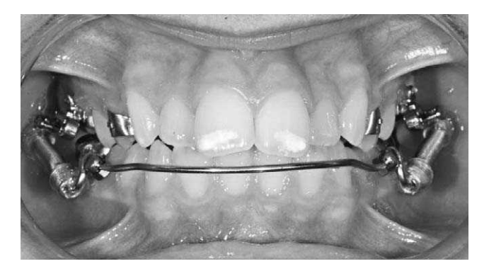
Figure 4. XBow view with Forsus springs fully compressed in a nonpropulsive CR relationship.

All patients were under the age of 17 years, and their pretreatment (T1) and posttreatment (T2) cephalomet-