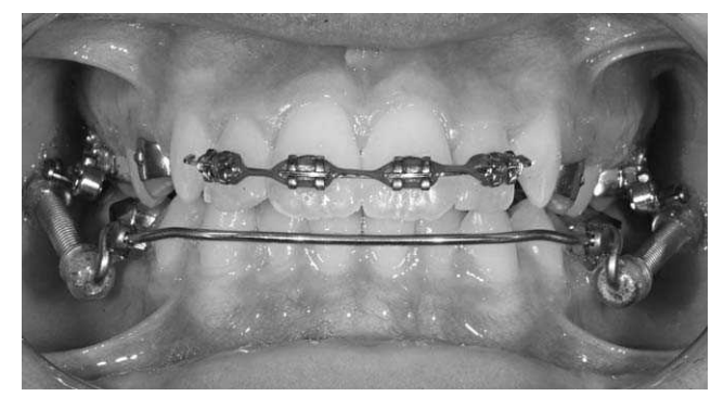
Figure 1. XBow with brackets on maxillary anterior teeth to decompensate incisors during Class II correction.

In a systematic review<sup>11</sup> evaluating treatment changes resulting from Herbst therapy, it was determined that dental changes were more significant than skeletal changes in the final occlusal results. Since most of the correction is dento-alveolar, auxiliary devices that are mainly believed to produce dentoalveolar changes, such as the Forsus<sup>™</sup> device, may serve as a good alternative. The Fatigue Resistant Device, more commonly known by its trade name "Forsus," has gained widespread acceptance in recent years as a replacement for other Class II treatment alternatives while in full fixed edgewise appliances. This device was developed by 3M Unitek (3M Unitek, Monrovia, Calif). Since its introduction in 2001 several modifications<sup>12</sup> have been made by the manufacturer to enhance fatigue resistance and improve patient comfort. The development of the Forsus evolved through a combination of trial and error and CAD/CAM technology. When fully compressed, the spring force is approximately 200 g and was designed to correct a Class II malocclusion in 6 months while simultaneously enduring the demanding oral environment. It is mentioned that the available attachment variations makes it universally appealing, easily modified to adapt to various oral sizes and shapes.