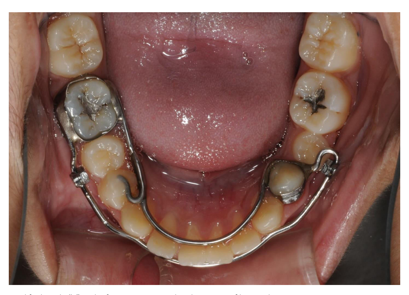
Modified Triple "L" Arch after spring removal and eruption of bicuspid