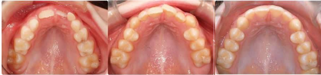
Initial _____ 4 years after maxillary expansion _____ 2 years after Xbow, no braces used