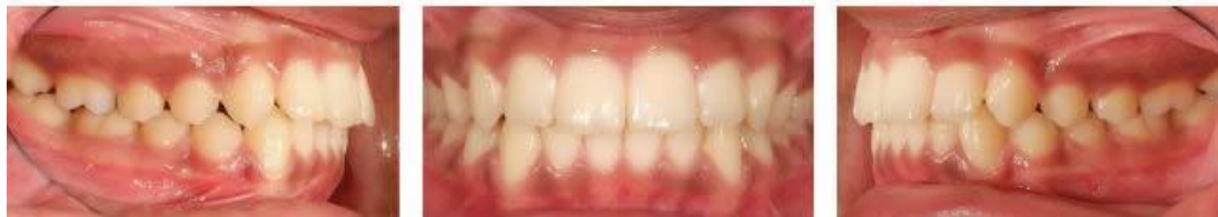
1. Upper 2X4 (4 incisor brackets) 2. Xbow 4 months (7 months after Forsus spring removal. Full braces have not been used)