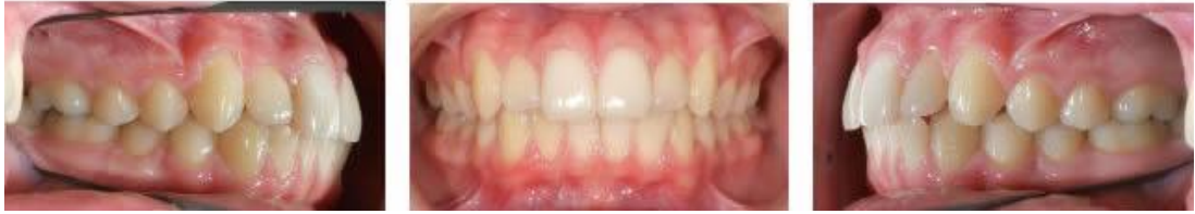
Xbow 6 months. After photos taken 14 months after spring removal. No braces have been used.