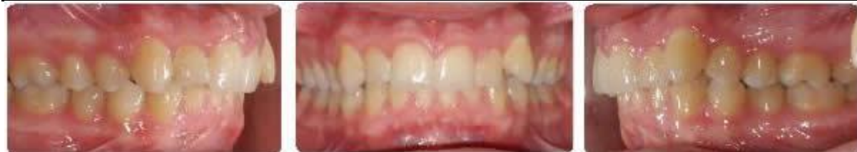
Initial (first bicuspid relationship 1mm Class II right, 4mm Class II left)