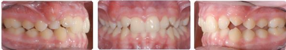
2 years after maxillary expansion