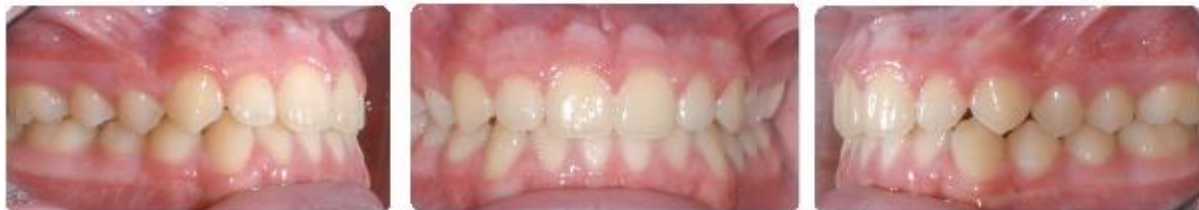
partial upper braces and Xbow with springs for 3 months followed by maxillary expansion, full braces have not been used