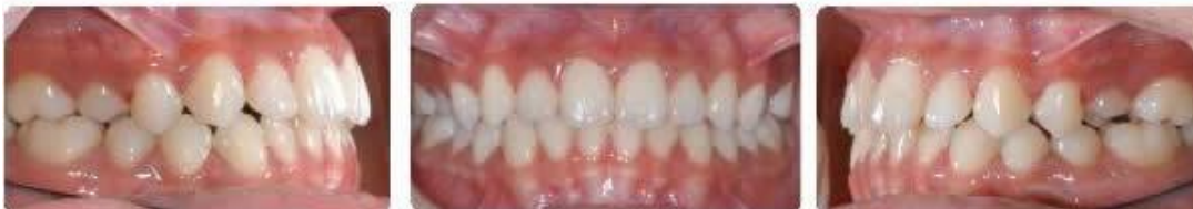
1. RME 2. Xbow 3 months 3. RME